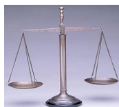
Keep Your Cells In BALANCE!!