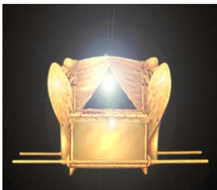
MEM Inc. Your Gateway to Ancient Secrets

can be heated and the vapors inhaled for relaxation and aromatherapy that is unmatched by any other product.