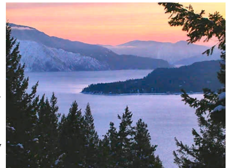
Mineral are the Key Building Blocks of Nutrition

womb, the pluripotent stem cells of the human fetus utilize hydrogen, oxygen, and various mineral ions from the mother's blood to form diverse cells of tissue that develops into organs, and cartilage that eventually will become the bones of the human skeleton. A quick analysis of the tissue, organ, and bone structure of a newborn baby (as well as that of a mature adult for that matter) will confirm the truth: the infant is nothing more than water and approximately $5 worth of mineral elements. Yet, the infant is infinitely priceless to their loving, and nurturing family. The miracle of life simply involves hy-