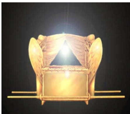
Frankincense: Your Gateway to Ancient Secrets