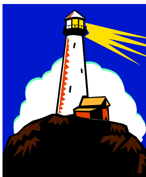
KNOWLEDGE IS POWER