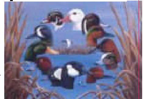
Wild Waerfowl are NOT the source of "Bird-Flu"