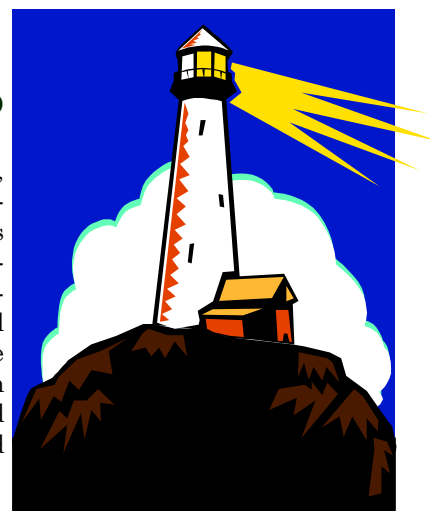
KNOWLEDGE IS POWER

cific frequency of energy field called Aura, Chi, Prana, etc. Science is only now beginning to understand that this energy field is inextricably connected to literally everything in the Universe—a Universal Consciousness if you will. When an individual opens his/her mind to objectively analyze and search for all truth, miracles are often the result. Understanding and increased knowledge then begins to flow to the mind and heart of the individual, and mankind is only then blessed with new, and exciting technology. A careful analysis of the lives of all innovators shows that this is true. Thomas Edison succinctly said it best at the end of his incredible life: "I am always learning!" I am convinced that today, extremely evil and conspiring men and women are combining to threaten Life, Individual Liberties, and the Pursuit of Happiness as never before in our nation's history. Individuals endowed by the Creator with passion for the preservation of these "inalienable rights" are today be labeled "Domestic Terrorists" and are wrongfully placed under unwarranted surveillance and harassment. America is under siege. Brainwashing via pharmacological methods (vaccinations) is rampantly out of control. Is it not time to take a loving stand?