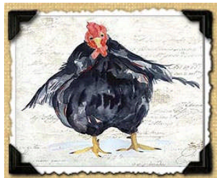
Bird Flu: It's Not What You Think!

financial windfall to certain pharmaceutical giants tied to Bush Sr., and Donald Rumsfeld. It is bad enough if that is what the “Bird Flu hype” is all about—money and increased profits to key politicians and lobbyists. What if the “agenda” is far deeper and darker however? What if a massive “pandemic” virus is in fact being designed in covert CIA labs, and systematically scheduled to be released in order to implement martial law across America? Before you laugh this idea away, keep in mind that a strong, economically vibrant America is a powerful roadblock to an all-powerful, “New World