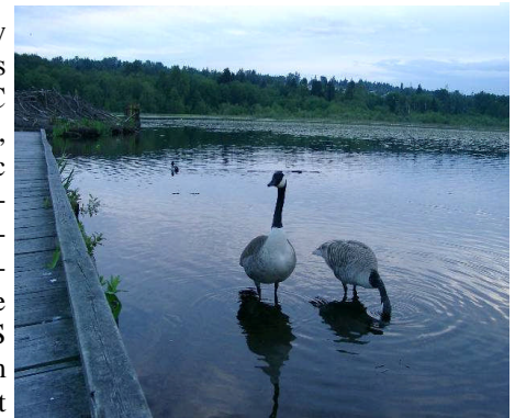
Health Officials somehow believe wild duck and goose populations will bring Avian Flu to America!

which actually posted a “Viewer’s Guide” to the ABC movie! (Apparently, the American public is incapable of forming their own opinions about the fear-based movie, Mike Leavitt and HHS had to tell them what to think about it!) The bottom line is simply this: the Bush Administration has allocated BILLIONS of dollars to HHS in order to “prepare for the inevitable pandemic.” Part of these taxpayer dollars have been spent in a very professional, very expensive 396-page “Planning Guide” that can be directly downloaded from the HHS website. In this “guide”, the government’s plans for extensive