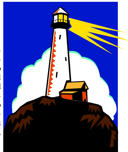
KNOWLEDGE IS POWER

dependent countries in a campaign featuring air superiority, ultra-modern, mechanized tanks and infantry, all designed to inflict a "shock and awe" (blitzkrieg) shell of superior "invincibility" on the conquered countries. Hitler attacked his own government and burned the Reichstag in order to galvanize public support for his expansionist war plan. Hitler utilized a secret, covert police force to spy upon his own citizenry, and lists were compiled on who he could trust, and who would be eliminated. Hitler had all the popular clergymen of Germany and Austria in his camp—because he paid them well and gave them unprecedented power and influence. Hitler maintained various concentration camps in Germany as well as "occupied territories" where his henchmen interred many hundreds of "political prisoners" without trial or formal charges. These concentration camps specialized in torture, and many committed suicide after enduring years of hopeless interment. In the end, it was the German people who paid the highest price for their blind indifference to the Nazi agenda. Many innocent millions paid for Hitler's devilish schemes with their lifeblood. Will America continue to follow the same path, or can we still stand tall?