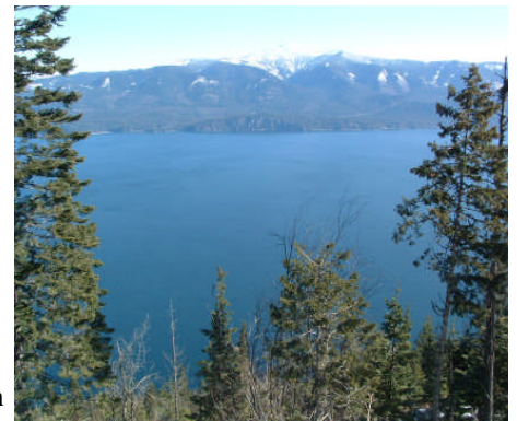
All Natural. 100% Organic is the Goal of Mother Earth.

The mineral Iron is a vitally essential nutrient that allows the cell to process carbon (I.e. carbohydrates and proteins) into energy. Iron (fe) particles when added to carbon based fuel such as gasoline and diesel, allow the carbon in fuel to burn much more efficiently, increasing fuel economy by as much as 20 to 30%. This simply means, instead of paying $3 per gal-