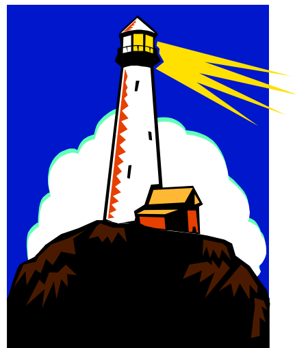
KNOWLEDGE IS POWER

philosopher Goethe may have declared this principle best when he wrote: "No man is more hopelessly enslaved, than he who falsely believes he is free!" Can a soul be truly free when one is chronically ill? Can a young person freely develop his/her mind and talents when shackled with obesity and the daily consumption of brain-numbing chemical drugs such as ritalin and prozac? When a young person develops diabetes from consuming supposedly "harmless" food additives, what freedom can such an individual enjoy when having to receive daily injections of synthetic insulin? All of these invisible chains and shackles are imprisoning millions of ignorant Americans—because of the falsehoods and errors propagated daily by American big business concerns. It is time for America to learn the Truth and is time for the Truth to set Americans free. Sadly, it has been my experience that "Big Business buries the Truth". For some reason, Big Business does not want Americans to be given the facts they need to make wise decisions in their lives. Madison Avenue advertising firms spend billions to make poisons look desirable and "harmless". Secret Assassins in Food contains many Truths that may set you free.