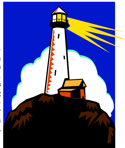
KNOWLEDGE IS POWER

equivalent of 5,000 milligrams of CONCENTRATED AquaVivos to the ratio of a kilogram of the test rat's body weight as the starting point of the toxicology study. It was fully expected that the test rats would not survive that much product being injected into them, but they not only survived the required 14 days, but actually exhibited signs of superior nutrition, such as glossy fur, increased energy, low stress, etc. Therefore, the lab certified that the product's LD-50 rating is simply greater than (>)5,000 mg./kg. body weight. This is incredible news, because it means that AquaVivos is over 100 times less toxic than pure table salt. It also means that the product can be used safely and with confidence in its many different applications. We are so blessed to be able to report that many of the chronic health challenges tied to poor hydration factors (cancer, diabetes, arthritis, atherosclerosis, etc.) may possibly be reduced with regular consumption of this miracle of the vegetable kingdom. We understand with all due humility, that all credit for the development of AquaVivos must rest with the master creator of the polyphenol molecules as found in nature—for without them, the AquaVivos product would not be possible. Thanks!