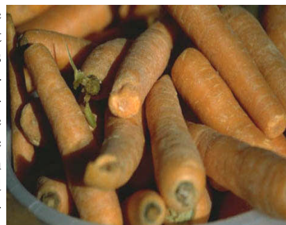
AquaVivos™ is derived from phyto-nutrients called PolyPhenols - extracted from organic CARROTS!

ATP is an unstable molecule of oxygen that has simply lost electrons following the ATP production cycle. This unstable oxygen molecule is called an Oxygen Free Radical. Other electron deficient elements and compounds such as toxins released from heavy metals, chemicals and excretions from pathogens such as parasites, viruses, and bacteria are also unstable "free radicals" and are continuously attacking the cells in order to gain electrons. The more free radicals present in the body, the more stress is created on the cellular level, and the more likely one is likely to develop a chronic disease state. For instance, it is commonly recognized that cancer is ultimately caused