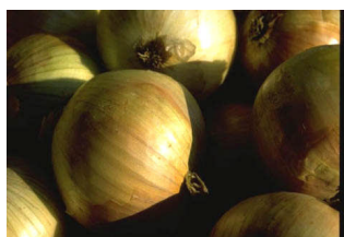
Onions are also a part of AquaVivos

Simply stated, the higher the raw vegetable's polyphenol level, the higher its ability to neutralize free radicals in a natural, non-hazardous chemical process, and thus, the higher the potential "healing energy" of the vegetable. This helps to explain why many individuals have boosted their immune systems and successfully reversed a wide variety of chronic disease states simply by juicing raw vegetables and limiting their consumption of red meats. The product named AquaVivos contains concentrated polyphenols extracted from root vegetables such as carrots, onions, turnips, radishes, and soy root. The polyphenols are then stabilized by an electro-